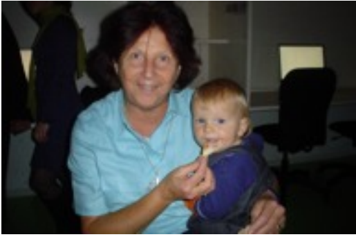
Geneva, March 2008